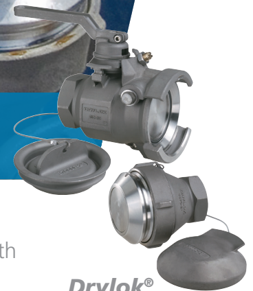
Drylok® Dry Disconnect Coupler